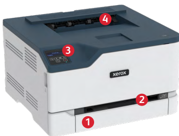
Xerox C230 Color Printer