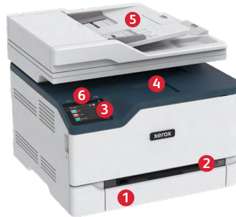
Xerox C235 Color Multifunction Printer