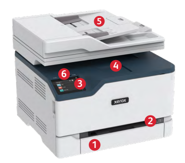
Xerox C235 Color Multifunction Printer